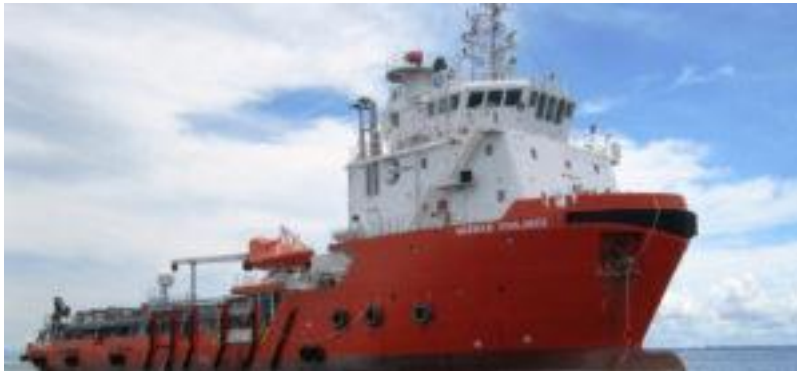
Research Vessel R/V Mermaid Vigilance