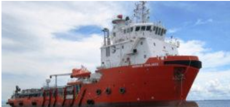
Research Vessel R/V Mermaid Vigilance